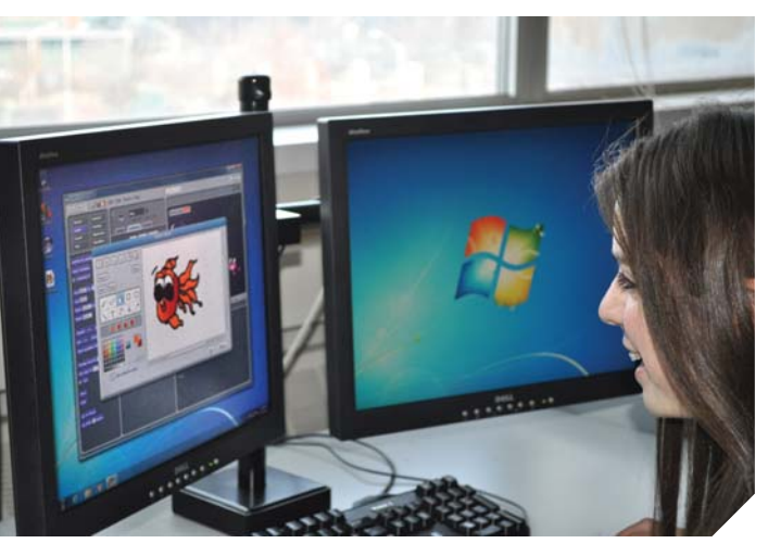
A dozen MSU volunteers helped girls at the Women in Computing technology workshop create websites, games and animations.